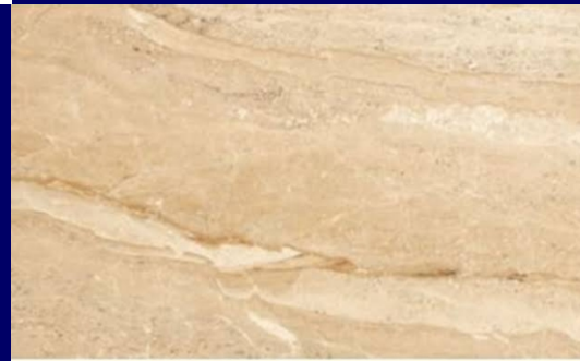
& many more...